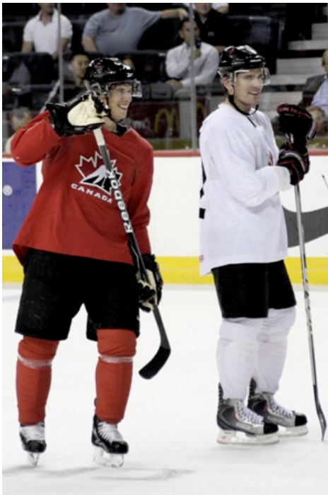
Patrick Sharp (right) and Sidney Crosby share a laugh during the Canadian men's Olympic hockey orientation camp in Calgary Aug. 24-27.

Sharp feels the man who was his first NHL coach back in his days with the Philadelphia Flyers as well as the bench boss for Canada at the 2008 World Hockey Championships, in which Sharp was also a part, has its advantages in attempting to earn an Olympic roster spot.